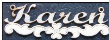
.02" Gold - Cut and Engraved

Several laser systems and 2D scanner/verifiers will be available. Participants are welcome to bring materials for live processing.